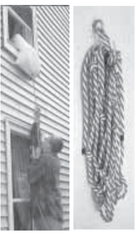
Pillo w on window sill (left) protects ou from being cut as you climb down to safety. Rope hangs on room wall in a central location.

Contact: FARM SHOW Followup, C.F. Marley. P.O. Box 93, Nokomis, III. 62057 (ph 217 563-2588).