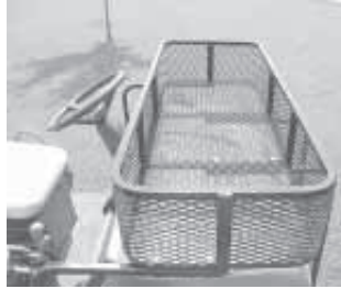
Front basket is used for carrying supplies and tools (above). He also mounted a twopiece receiver hitch on back of his Gator