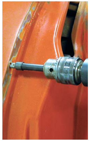
Spotweld cutter consists of an arbor with a pilot on it that helps line up the hole, and a cutter that screws onto arbor.

Contact: FARM SHOW Followup, Blair Equipment Co., P.O. Box 2005, Flint, Mich. 48501 (ph 810 635-7111; info@